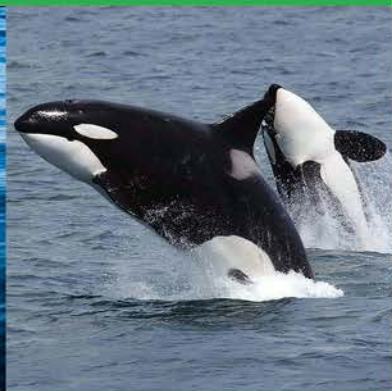
Killer whale / Orca